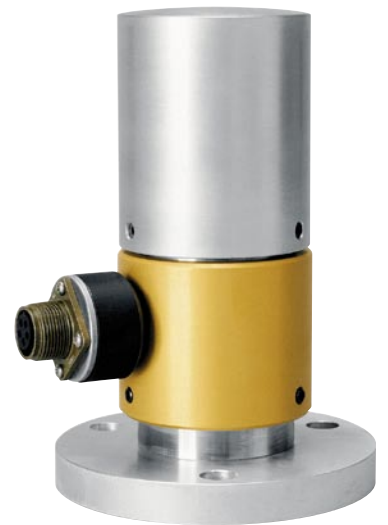
SGMC Includes cap and base.

See back page & Dillon Load Cells specifications sheet for more dimensions and detail