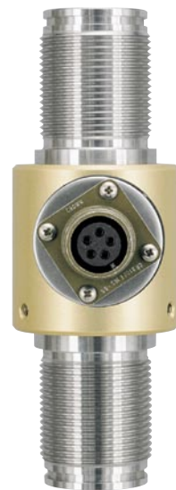
SGMT Designed for overhead suspension. Optional eye nut available.